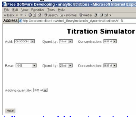
Fig. 1. http://academicdirect.ro/virtual lybrary/molecular dynamics/titration/v1.1/

The user select desired options and press submit button (Make) to send data through a post method to titration.php located in same directory. For substances, values that are sending are constants of equilibrium.